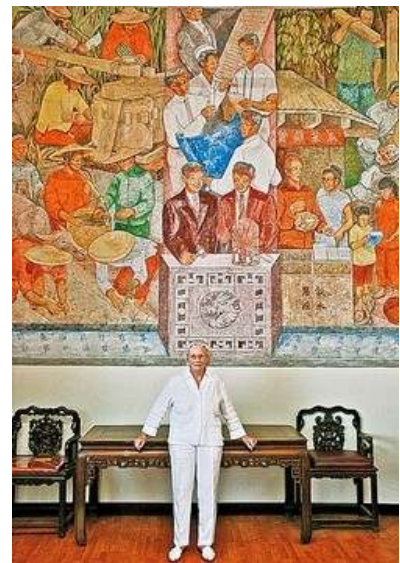
Beverly Willis' 1954 fresco commemorates three generations of Chinese in Hawai'i. Tomorrow the artist will be honored by the United Chinese Society.

Inside the United Chinese Society building on King Street, a grand, 10-foot high, 15-foot-wide mural commemorates the first three generations of the Chinese in Hawai'i. A real fresco, with pigments painted into wet plaster, it is done in the manner of the old masters.